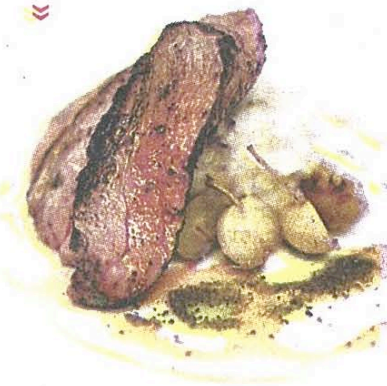
Pan-roasted Duroc pork at small-plates specialist Vero in Amityville

All Vero needs is a Vespa parked outside and some paparazzi at work to complete the Italia moderna image. The lively small-plates dishes celebrate on Feb. 14 with specials that will include Blue Point oysters with pomegranate granita; vegetable-stuffed shrimp in puff pastry with mustard-shallot sauce; an open raviolo of lobster; pan-roasted beef tenderloin with Gorgonzola cheese, black truffles and a Marsala-blood orange sauce; and wine-poached pear with chestnut mousse.