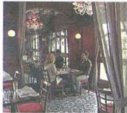
Aperitif offers a fixed-price menu to suit couples.

This updated bistro, warm and welcoming, has enough Parisian imagery and flair to suit the day of hearts. And there's a $60 fixed-price menu to supplement the regular one on Valentine's Day. Highlights include lobster bisque, grilled filet mignon with garlic-mashed potatoes, and a trio of "crusteds" — pistachio-crust sea scallops, potato-crust halibut and walnut-crust rack of lamb. Sweets: fruit napoleon, crème brûlée, chocolate cake.